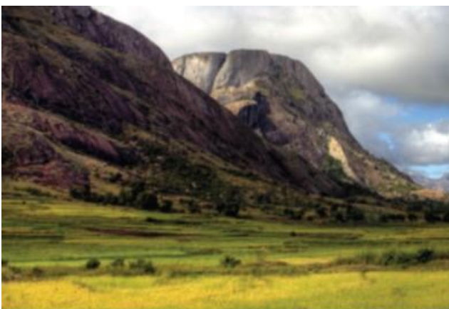
The landscape of Anja:

Key Words: Development, Conservation, ecotourism, use