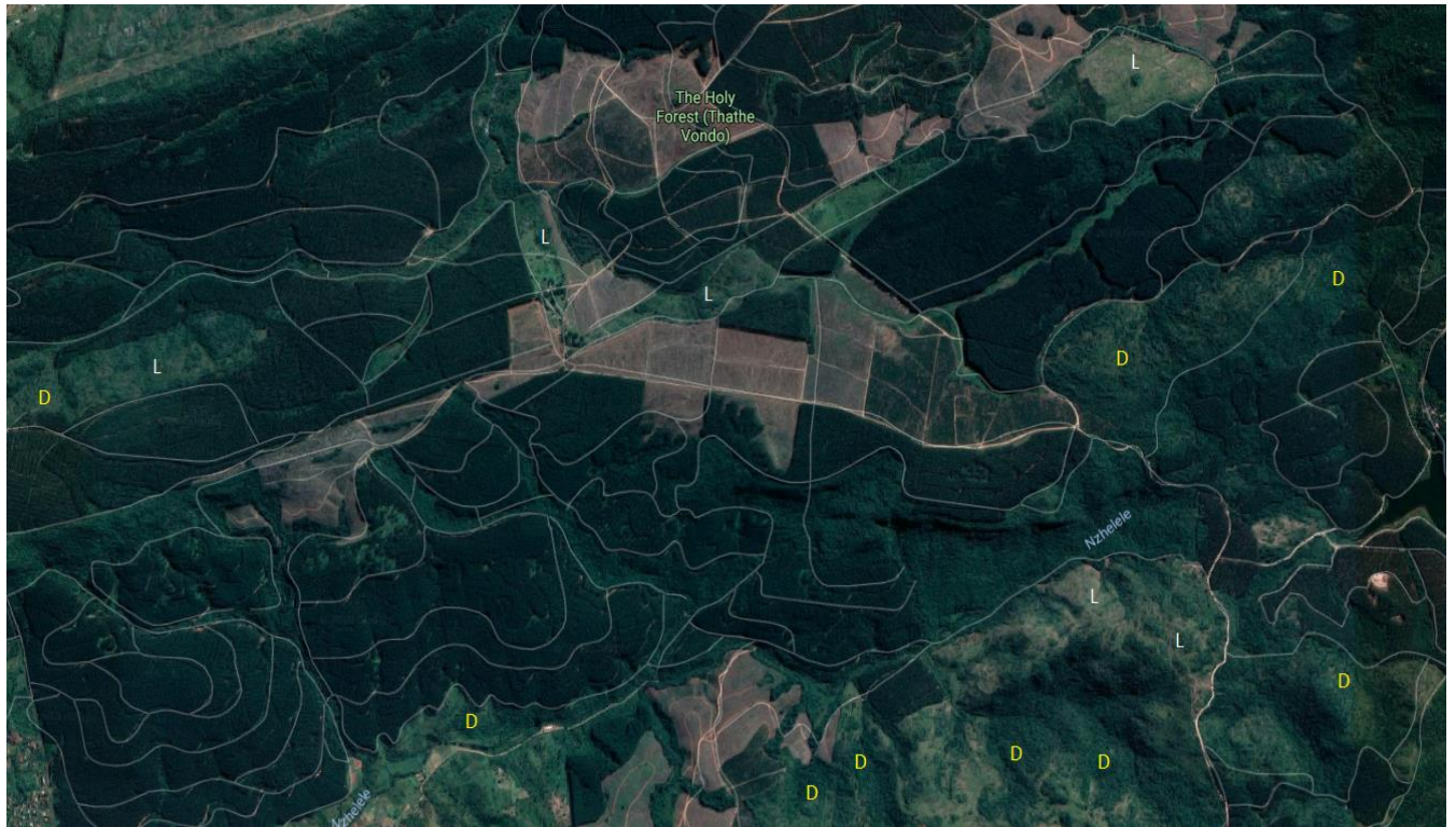
Figure 2: Forest and plantations around Thata Vondo showing areas of forest loss (L) and degradation (D).